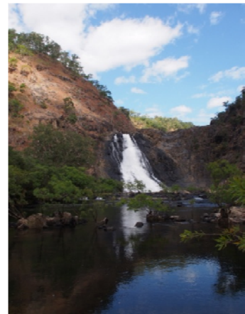
Wujal Wujal Falls

As I formulate this piece of world wide webography, we are staying at Cape Tribulation, the start of Cooks problems with the Barrier Reef.