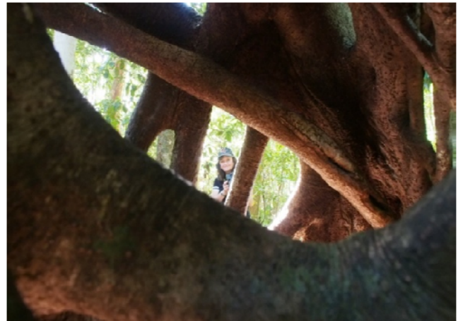
Strangler Fig (host tree completely rotted away)