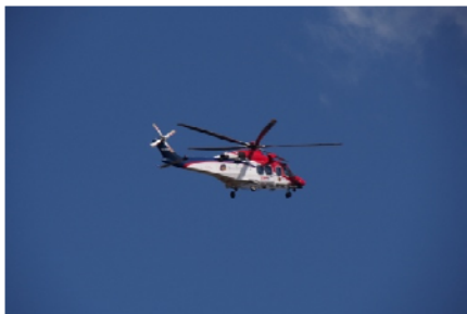
Express to 2 weeks of free R and R.