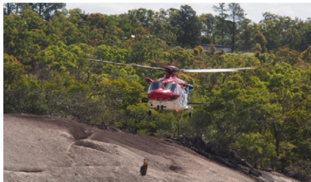
First class helicopter pick up, no effort, they are winching straight in.